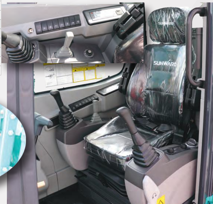
Enclosed cab offers Air Conditioning, LCD Touchscreen, and fine control features